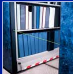
Aisle-Entry Safety Sensor