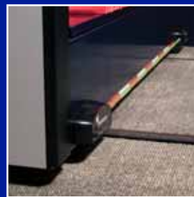
Light-Immune Photo Sweep

Eclipse means configurability. Customize your Eclipse Powered System by adding to its standard features just the options you need and will use right now. Then add more options and functionality as your needs evolve.