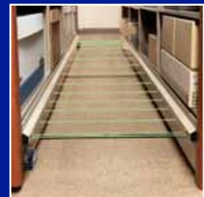
Zero Force Sensor System