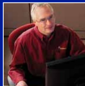
PowerLink Remote 24/7 Monitoring