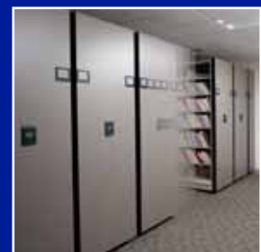
Auto Move Interface