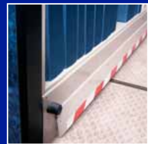
Mechanical Safety Sweep