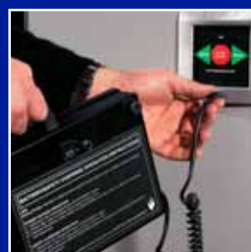
Rechargeable Power Override Unit