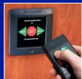
Infrared-Capable Control with Remote User Key