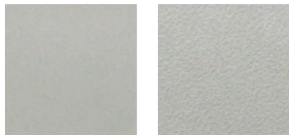
SX – Starlight Silver (145)