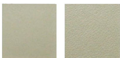
OM – Old Gold (221)