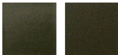
ZM – Bronze (217)