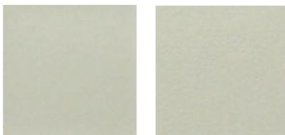
MO – Moonbeam (220)