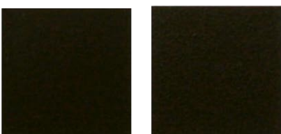
EX – Espresso (151)

There is a 10% upcharge for metallic colors. Rotary is only available in textured paint.