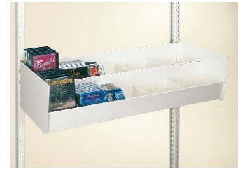
Two-Tier Multimedia Browsing Box Divider type – each 36" wide (914 mm) unit stores approximately 48 VHS or 110 CDs.