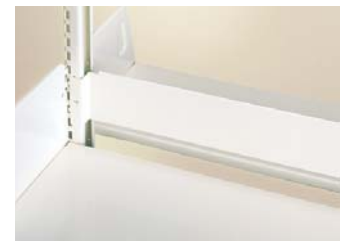
Offset Centerstop Eliminates the need for two independent shelf backstops. Can increase shelf depth by 1" (25 mm).