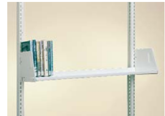
Sloped Adjustable Shelves With Integral Low-Back Shelf is sloped to aid viewing of displayed items. Unit is compatible with integral low-back dividers.