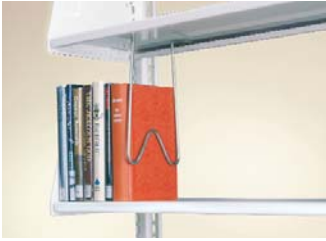
Hanging Wire Support Squeeze type, available in three sizes for five different shelf depths.