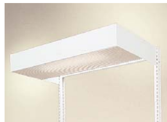
Canopy Light Illuminates display shelves and brightens dimly lit alcoves. Includes white prismatic diffuser.