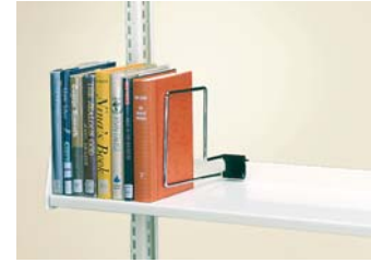
Integral Low-Back Dividers For low-back shelves, available in three sizes for five different shelf depths.