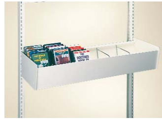
Multimedia Browsing Box Each 36" wide (914 mm) unit stores approximately 42 VHS tapes or 100 CDs.