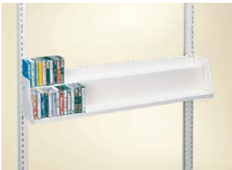
Two-Tier Audio Cassette Tape Shelf Each 36" (914 mm) shelf holds approximately 100 audio cassette tapes (50 per tier).