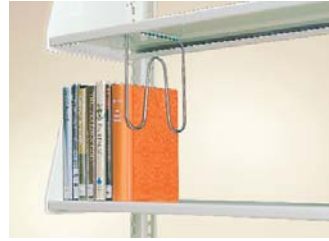
Snap-In Hanging Wire Support Available in four different sizes.