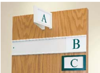
Aisle Identification Options Optional range finders and card holders make locating and reshelving of materials fast and easy.