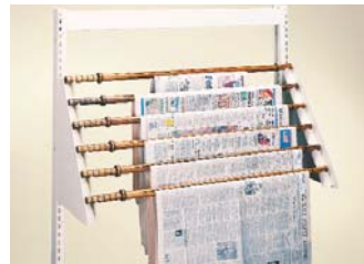
Six-Tier Newspaper Rack Efficiently displays up to six newspapers for easy identification and retrieval.